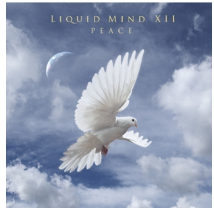
Album cover from Liquid Mind XII: Peace